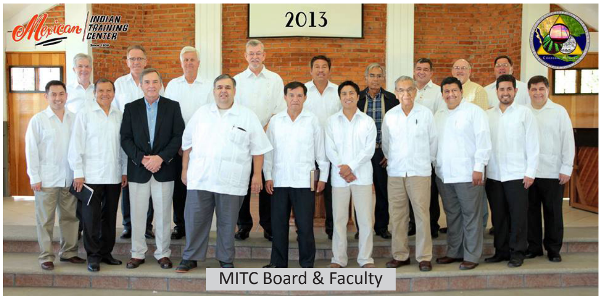
MITC Board & Faculty

One of the special blessings we have here at MITC is working with