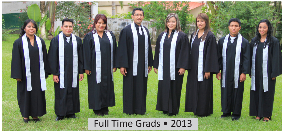
Full Time Grads • 2013

will be courageous in faith and strong in His Spirit and will be used for a mighty work, for the Glory of Jesus and His Eternal Kingdom! We were also greatly encouraged and blessed at this time with the presence of a good number of our MITC board members. These men represented all those who make this work possible by following God's prompting to serve Him